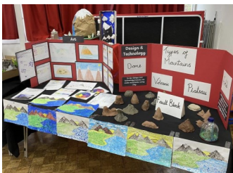
Year 4 Exhibition Work

Year 5's enquiry linked to our reading text, ‘The Secret Garden’ by Frances Hodgson Burnett. We have written narratives, newspaper reports, non – chronological reports, diary entries and formal letters. We have explored the book through our Reading sessions and really tried to understand the plot twists, characters and use of language. In Geography, we have looked at different types of farming and how conditions and different climates impact on farming and agriculture in Europe and Asia. The children completed very detailed and creative double-page spreads to bring together all that they have learned about the impact of climate on farming. The children also learned about The Great Famine and learnt by acting out scenes from this tragic event in the history of Ireland, as well as demonstrating their understanding by writing emotive narrative poems. To end the topic, we showcased our learning in an exhibition.