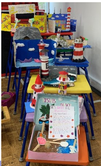
Year 2 Enquiry project work

inspired by the artist Katsushika Hokusai and drew a landscape of a beach. They used different materials and techniques such as scrunching and folding to create a collage. In D.T, children designed and produced their own beach huts! They had to use complex skills and a variety of equipment to produce an appealing and functioning beach hut. Year 2 have worked extremely hard this term. Well done!